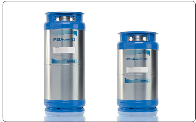
MELAdem® 53 and MELAdem® 53 C