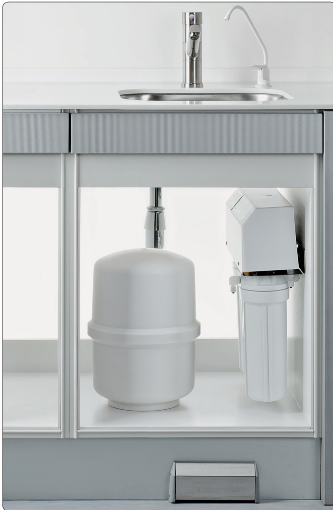
MELAdem®47 with removal valve and storage container, fitted in a floor unit