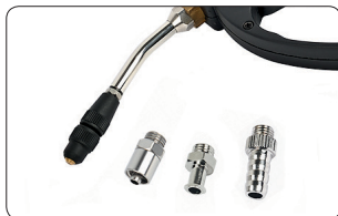
Fig. left: MELAJet® with individual attachments