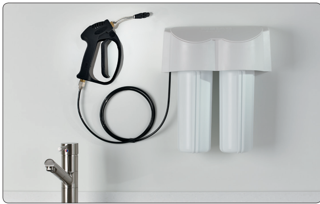
MELAJet® installed on the MELAdem® 40