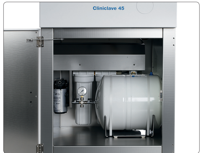
MELAdem®56 with storage container, fitted in a floor unit of the Cliniclave®45