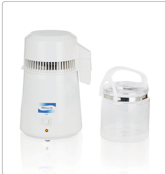
MELAdest® 65 with glass flask