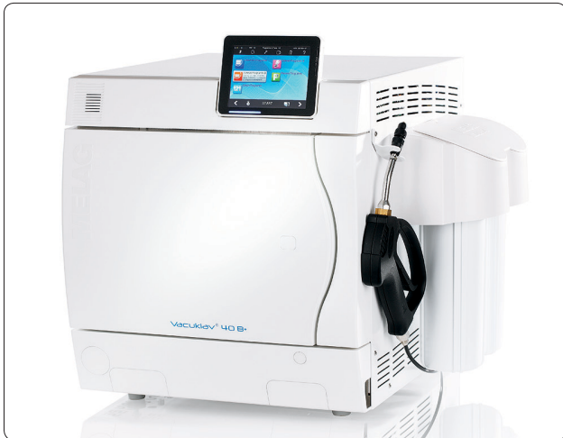
Vacuklav® 40 B+ with MELAdem® 40 and MELAjet® spray pistol