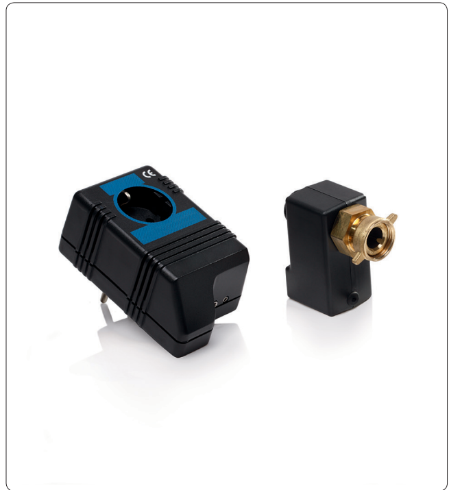
The water stop consisting of a control device (left) and a solenoid valve (right)