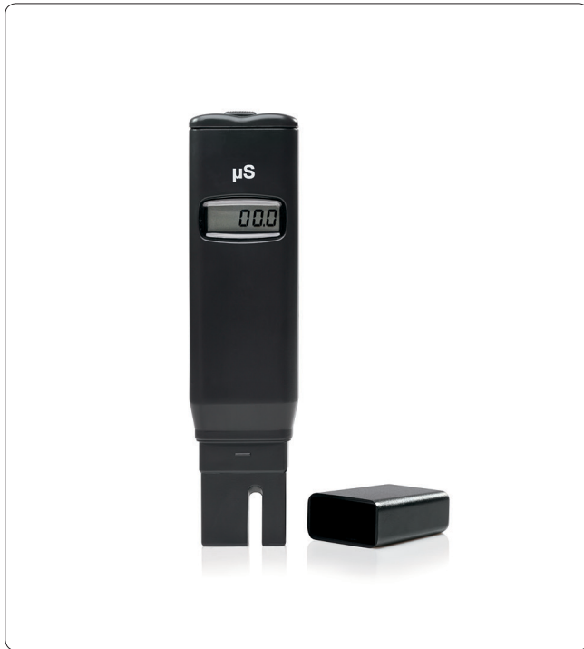
MELAtest® 60 inc. protective cap