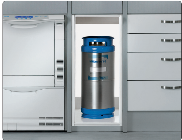
MELAdem® 53 fitted in a floor unit